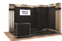
Premium all-inclusive package (white or black)

FOR MORE INFORMATION CLICK OR SCAN THE QR-CODE